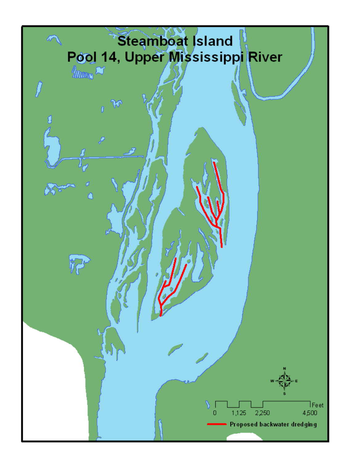
Figure 3. Proposed Project Features